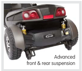
Advanced front & rear suspension