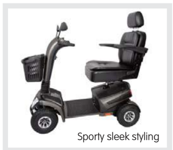
Sporty sleek styling