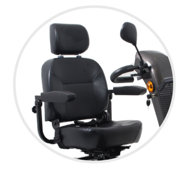
Large Deluxe spacious fully adjustable Captain seat, allowing you to get into the perfect driving position