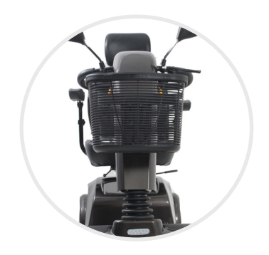
Large front Basket to carry all you need