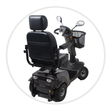
Great Turning Circle with large 13" tyres and all round suspension