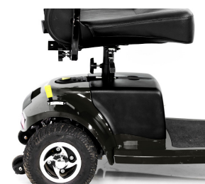
Lithium Vantage Battery Box weighs 6kg