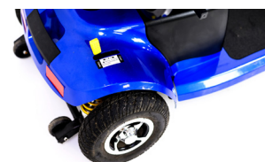
The Vantage and Lithium Vantage come with full suspension