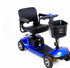
All the Vantage range come with a heavy duty motor