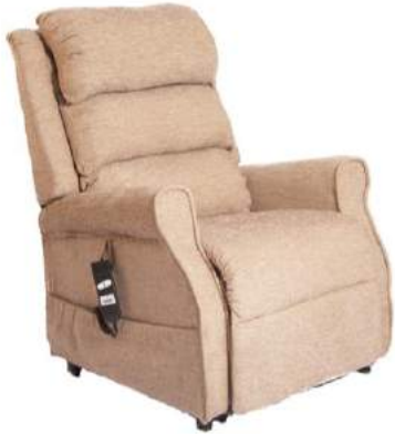
STANDARD SEATING POSTION

The chair has a range of electrically operated adjustments that can be operated using the control handset, specifically as shown below: