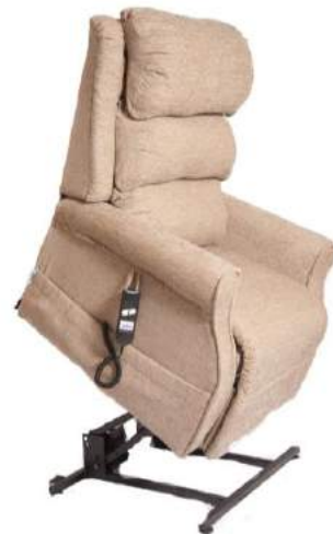
STANDING UP POSTION