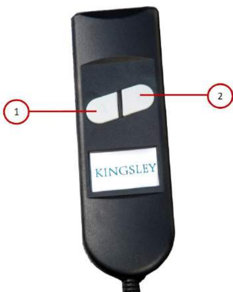
TWO BUTTON HANDSET (Single Motor Chair)