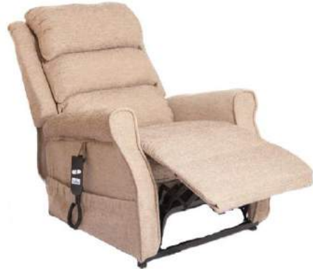
LEGREST ELEVATION POSTION