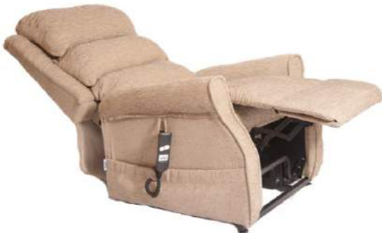
FULL RELCINE POSTION