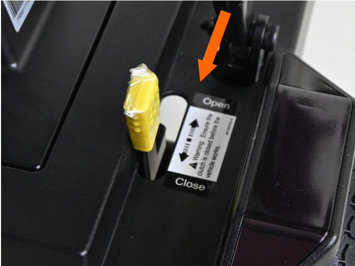
Fig 7.6.1 Drive Mode (Closed)