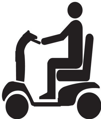
General driving posture.