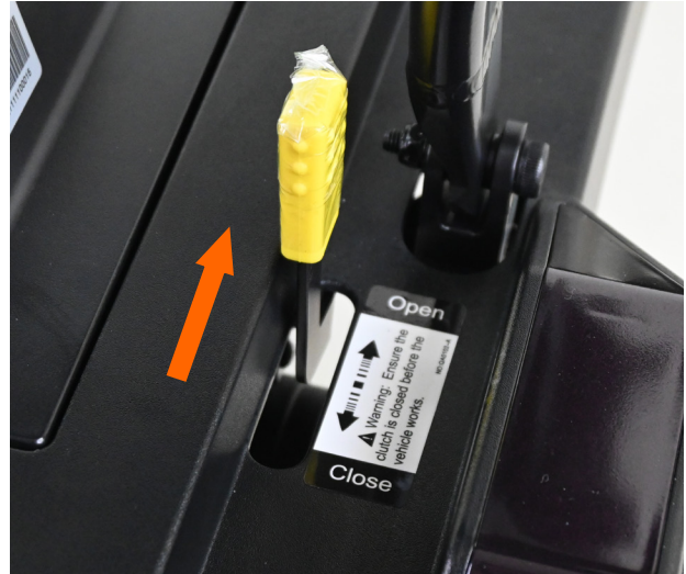
Fig 7.6.2 Freewheel Mode (Open)