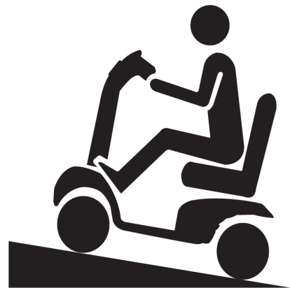
When driving up any incline move your body position forward.