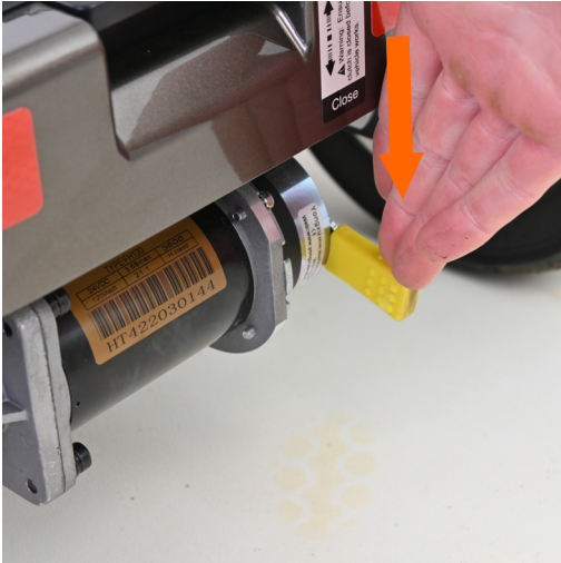
Fig 7.6.1 Drive Mode (Closed)

2. Freewheel position - is indicated by 'Open' - lift the lever upwards for this position. (Fig 7.6.2)