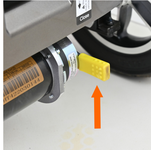
Fig 7.6.2 Freewheel Mode (Open)