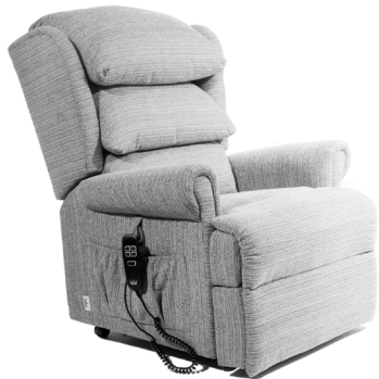
STANDARD SEATING POSTION

The chair has a range of electrically operated adjustments that can be operated using the control handset, specifically as shown below: