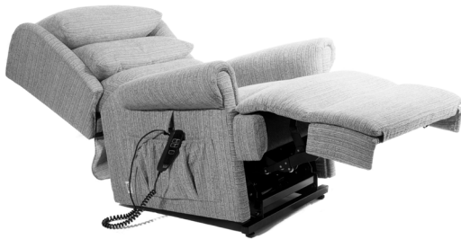
FULL RECLINE POSTION