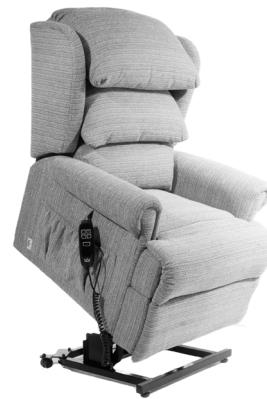
STANDING UP POSTION