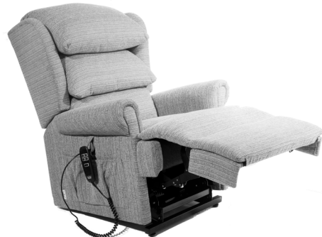
LEGREST ELEVATION POSTION