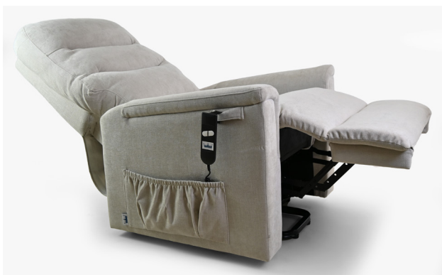
FULL RECLINE POSITION