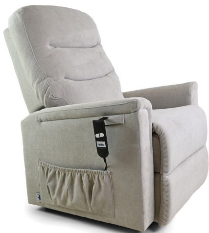
STANDARD SEATING POSITION

The chair has a range of electrically operated adjustments that can be operated using the control handset, specifically as shown below: