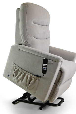
STANDING UP POSITION